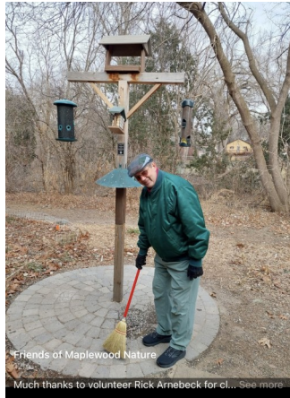
New Birdfeeder station