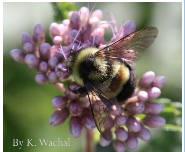
By K. Wachal

The significance of our work has been recognized by the Star Tribune in articles published 9/1/24 and 1/28/22. Final decisions regarding both properties are expected in 2025.