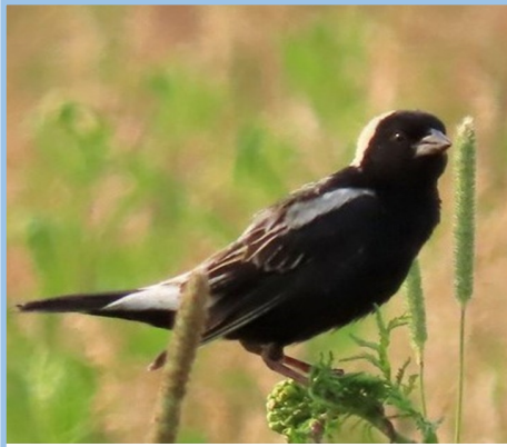
THE BOBOLINK, A SPECIES OF GREATEST CONSERVATION NEED IN THE BATTLE CREEK GRASSLAND.